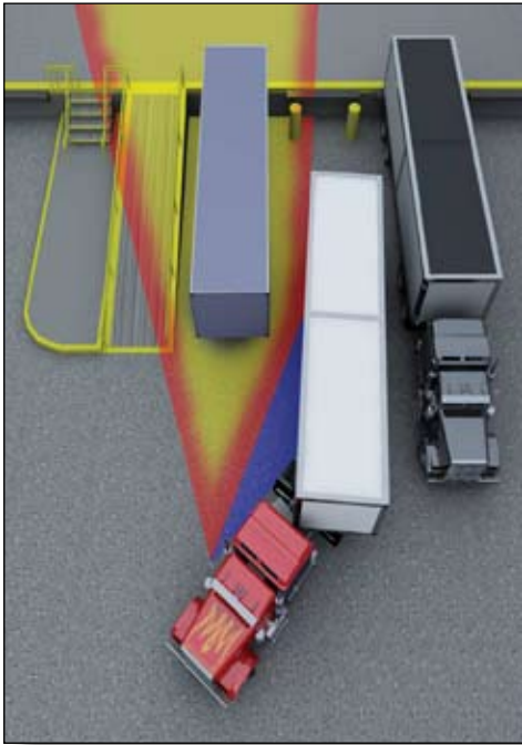
The purple area along side the truck depicts the normal area of coverage for a conventional mirror. The yellow area is the expanded vision area provided by LaneScan.